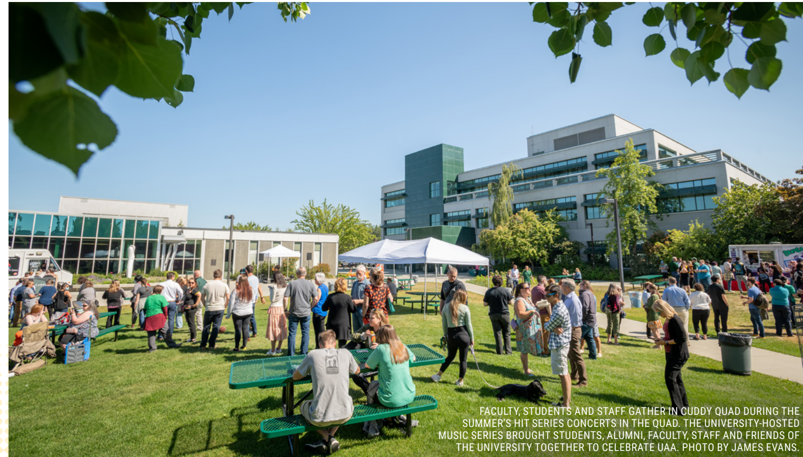
FACULTY, STUDENTS AND STAFF GATHER IN CUDDY QUAD DURING THE SUMMER'S HIT SERIES CONCERTS IN THE QUAD. THE UNIVERSITY-HOSTED MUSIC SERIES BROUGHT STUDENTS, ALUMNI, FACULTY, STAFF AND FRIENDS OF THE UNIVERSITY TOGETHER TO CELEBRATE UAA.