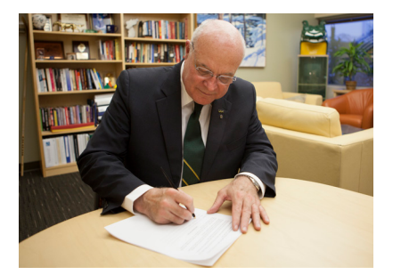
UAA proclaimed a Smoke Free Day on Nov. 21 in support of the American Cancer Society's national Great American Smokeout campaign and UAA's Smoke-Free Task Force.