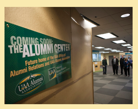
Alumni and students gathered for the ceremonial groundbreaking of the new Alumni Center, which will be housed in the Social Sciences Building, slated to open in 2014.

About 25 students, faculty and staff participated in the annual Nighttime Safety Walk in October. They tested emergency phones, noted lights out and missing signage — all of which are being addressed.