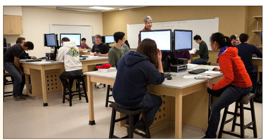
The three-year phased renovation of the Science Building is complete. This is the first whole building renovation to be accomplished at UAA in recent history.

in January, also addressed the broad network of K-12 educators, industry, government and nonprofits that make ANSEP such a success. ANSEP has impacted 1,000 middle school, high school, university students and alumni.