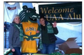
Alumni tailgate party

UAA alumni have a new interim board of directors and a full slate of programs to engage one of our most valuable resources.