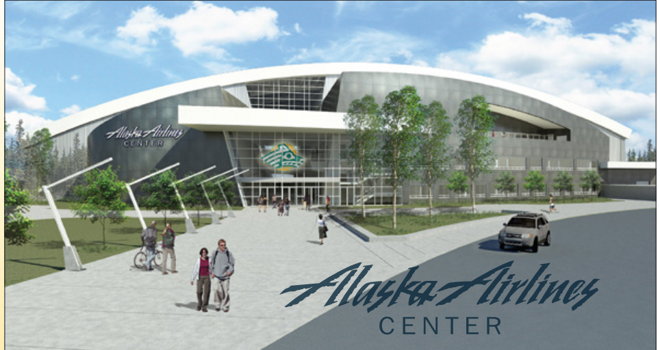
Architectural rendering of the Alaska Airlines Center slated for completion in 2014.