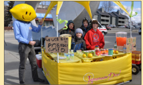
Alaska kids get a chance to learn about running their own business during Lemonade Day.

The Entrepreneurial Edge business education program, a joint effort of CBPP, CED, Alaska Pacific University, UAS and The Entrepreneurs and Mentors Network offers free speaker series this semester.