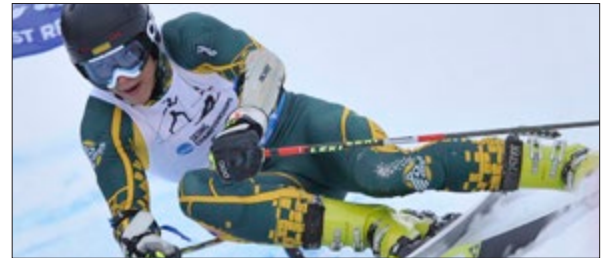
UAA qualified a full 12-athlete team to the 61st NCC Skiing Championships and finished eighth, capturing its seventh-straight top-10 result.