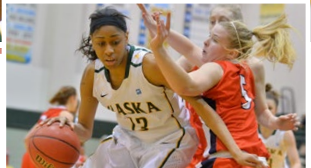
Seawolf women are NCAA bound, earning an at-large bid to the 2014 West Regional Championship.