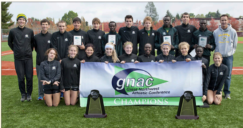
UAA men and women's winning cross country teams.