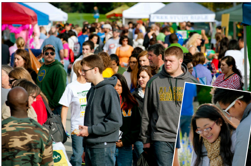
UAA Campus Kick-Off day crowd was full of eager new students.