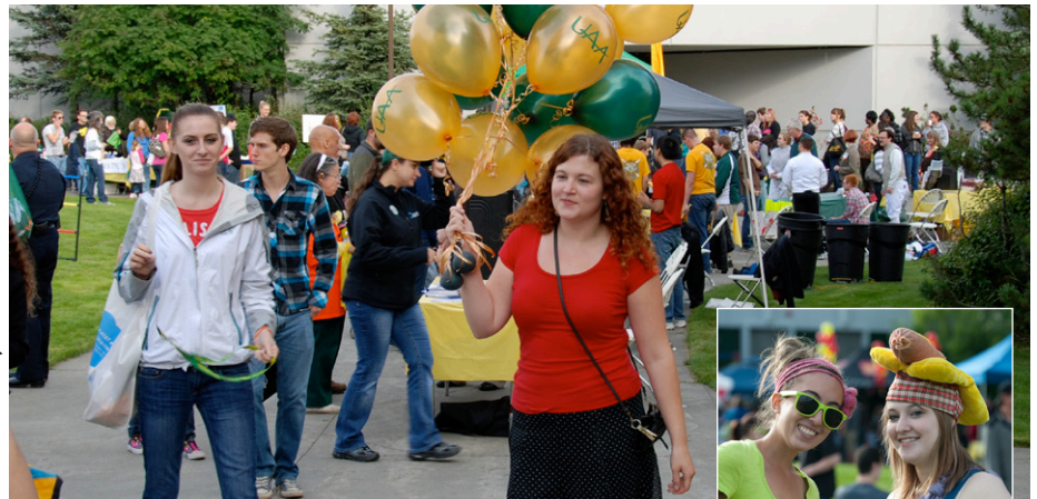
A new class of excited students swarmed the UAA campus during the Freshman Convocation and Campus Kick-Off.

school students from around the state as they completed a summer program motivating them to enter science, technology, engineering and math (STEM) fields.