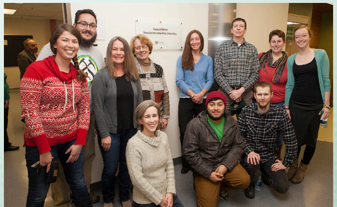
Faculty and students attended the naming ceremony of the ConocoPhillips Geoscience Computing Laboratory.

In December, the UAA Justice Center celebrated 40 years of leadership in civil and criminal justice education in Alaska, and in research on justice issues in rural and urban Alaska. The Alaska State Legislature established the Justice Center in 1975. Over the past four decades, faculty and research staff have contributed to studies ranging from the revision of the Alaska Criminal Code to the development of the master plan for corrections.