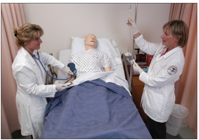
Kenai Peninsula College students learning bedside care of patients.

11. Consolidate, reduce, or eliminate programs, where indicated by program review, to assure the best use of limited resources.