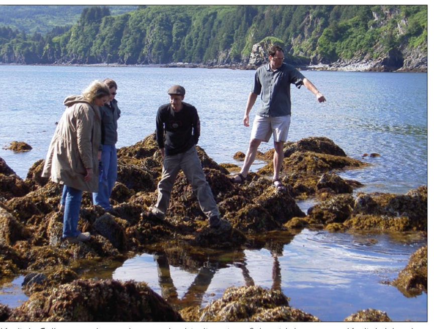
Kodiak College students observe the biodiversity of the tidal areas on Kodiak Island.