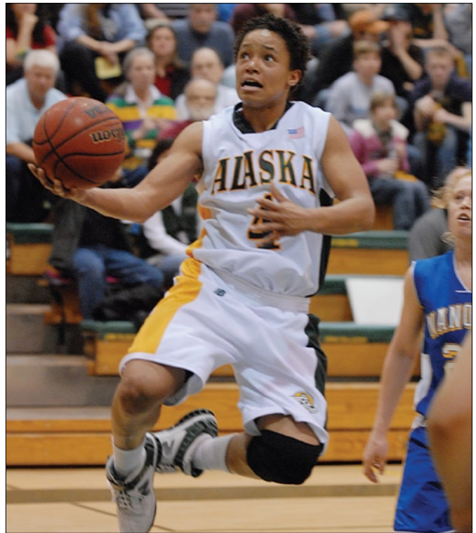
The 2008 women's and men's basketball teams set new records for collegiate play in Alaska.

1. Expand our commitment to make community engagement and service learning a cornerstone of our institutional identity;<sup>21</sup>