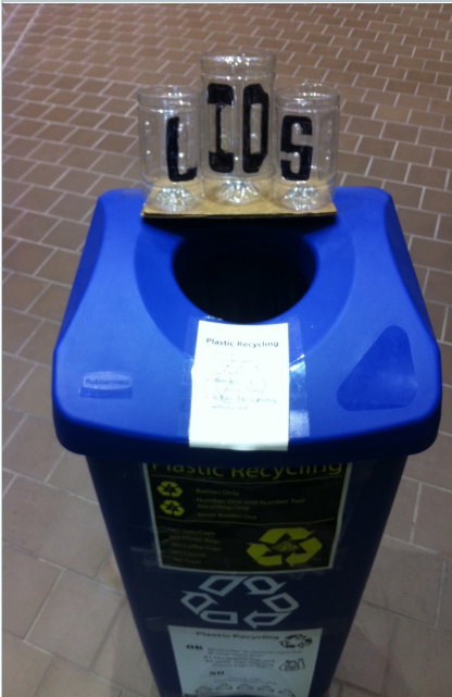
Blue UAA Recycle Bin

Look for the recycling bins across campus. They are various colors, shapes and sizes (dark green and blue primarily) but are always there for your recycling convenience. Maps of the locations of recycling bins are available at http://www.uaa.alaska.edu/sustainability/Recycling/pick-up-locations.cfm .