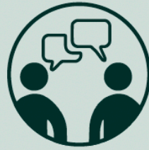
Science - Citizen Communication